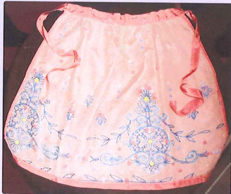
The Apron made from remnants of the bed hangings of Princess Olga's bed.

Over the years I have met many people who have some very strange ideas of what life was like in a convent school and particularly 'The School at the House'. Throughout the talk my aim was to dispel the myths and tell the truth, as I perceived it, about those happy days in a happy school surrounded by beauty both natural and architectural. After nearly 50 years it is an achievement to be able to speak still of my school with affection. Some memories will never die, at least not while I and my friends are around to recount them to anyone who will listen!